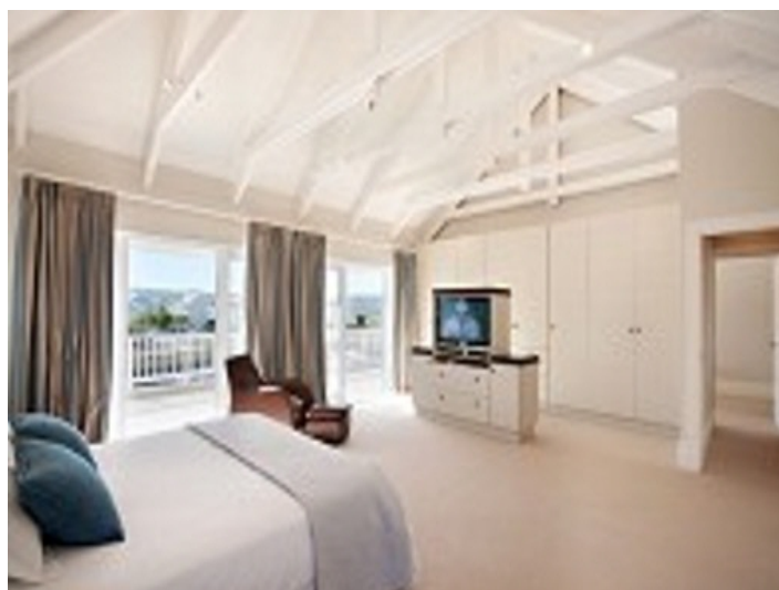
Conspicuous sleeping room

All information is correct to the best of our knowledge. Errors and prior sale excepted. This prospectus is purely for information purposes. Only the notarized deed of sale is legally binding.