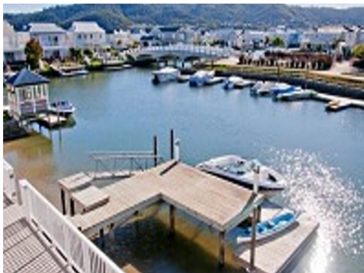
View to the harbor