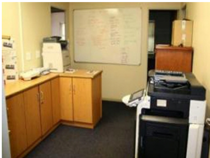
One of the 12 offices available in the building