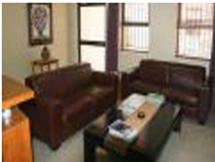
Bright and spacious office in South Africa

All information is correct to the best of our knowledge. Errors and prior sale excepted. This prospectus is purely for information purposes. Only the notarized deed of sale is legally binding.