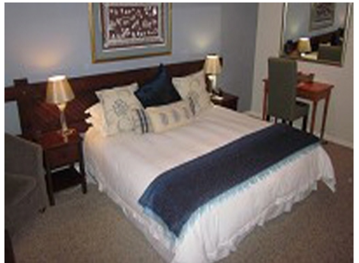
King size bed in one of the 8 bedrooms