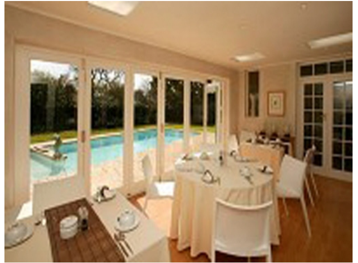
Breakfast area in the guesthouse