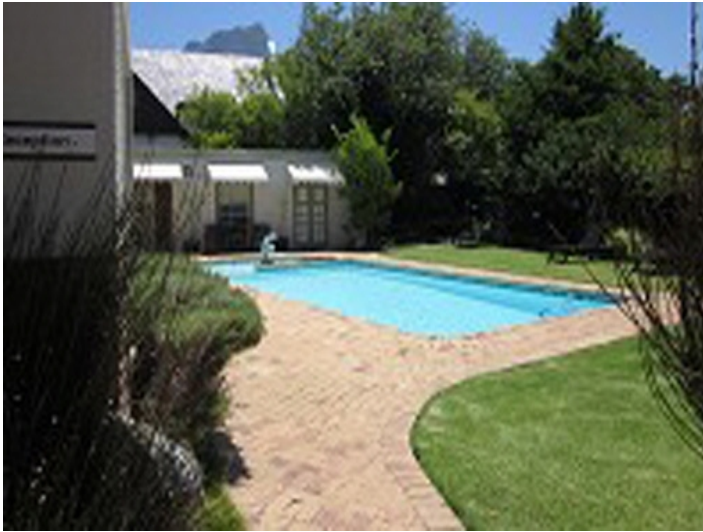
Path to the rest area with pool