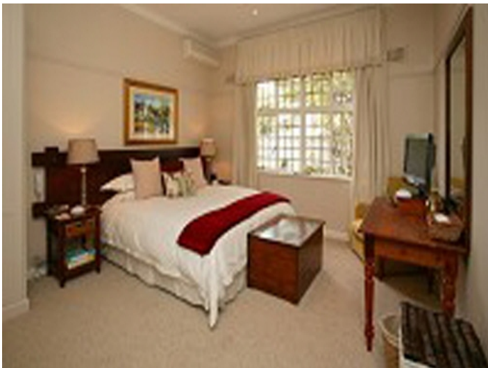
Nice and cozy bedroom