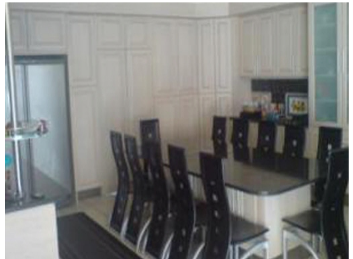
Big spacious dining area with big table