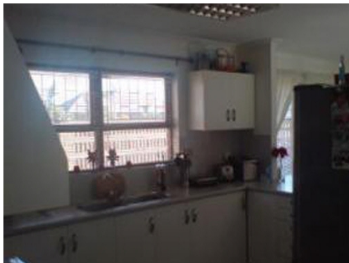
Bright and spacious kitchen