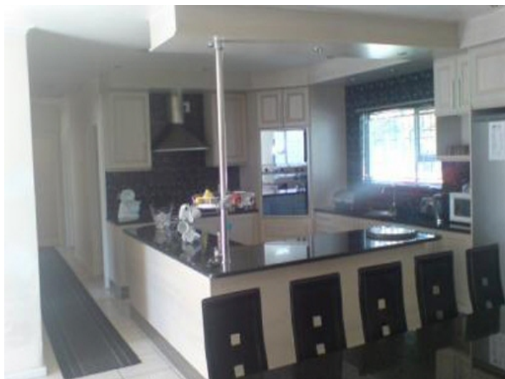
Kitchen area with granite plot