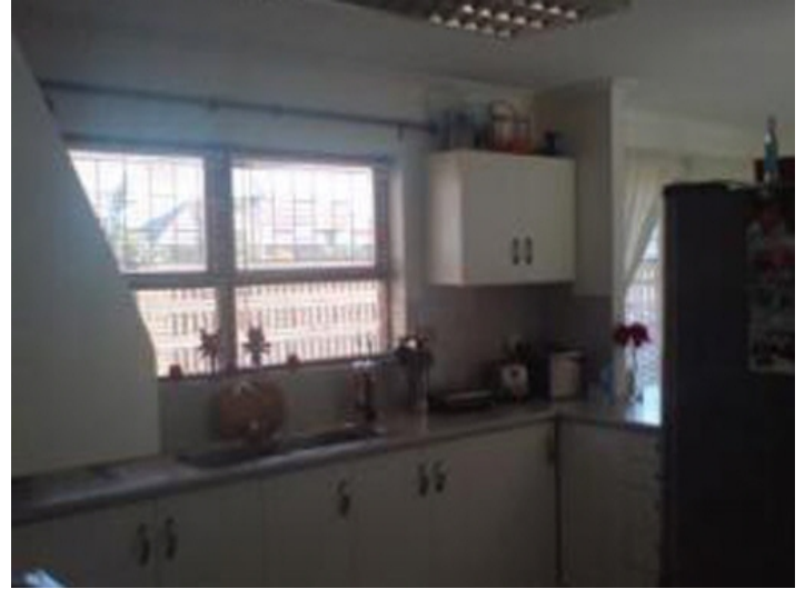
Bright and spacious kitchen