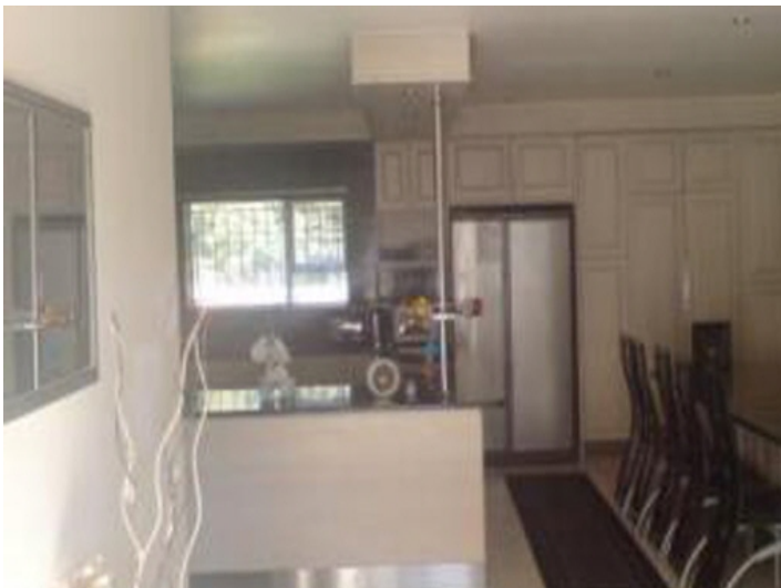
Dining area near the kitchen