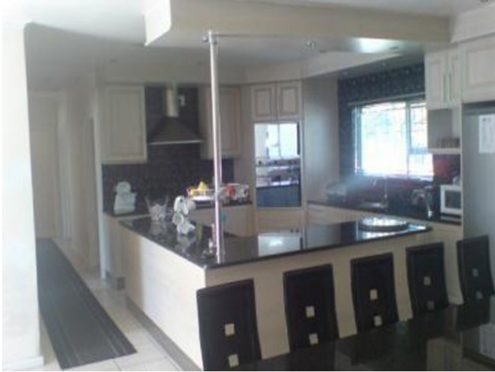
Kitchen area with granite plot