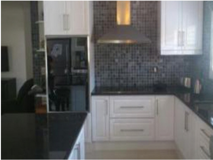
All you need kitchen area