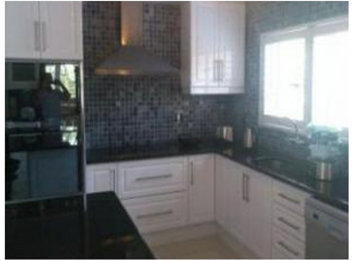
Nice and new kitchen