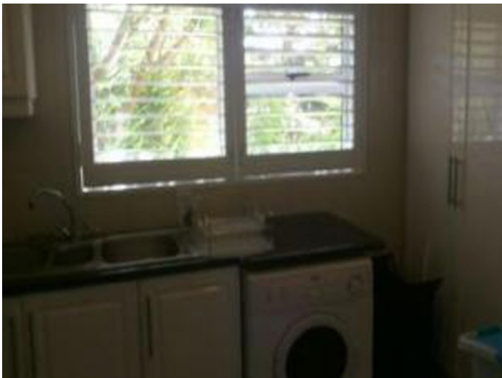
Laundry area available in the house