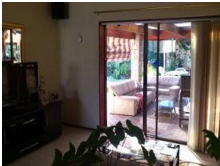
Huge and bright living area