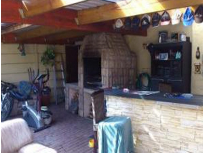
Outside rest area with build-in braai