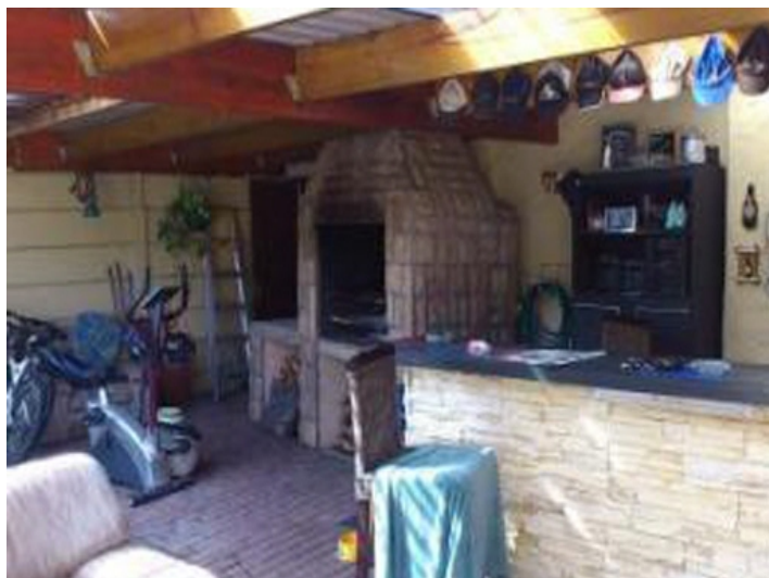
Outside rest area with build-in braai