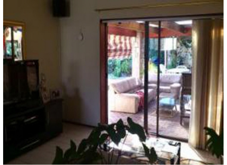
Huge and bright living area