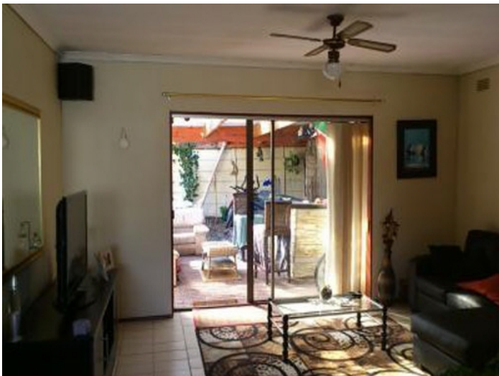
Living area with TV and access to the outside rest area

All information is correct to the best of our knowledge. Errors and prior sale excepted. This prospectus is purely for information purposes. Only the notarized deed of sale is legally binding.