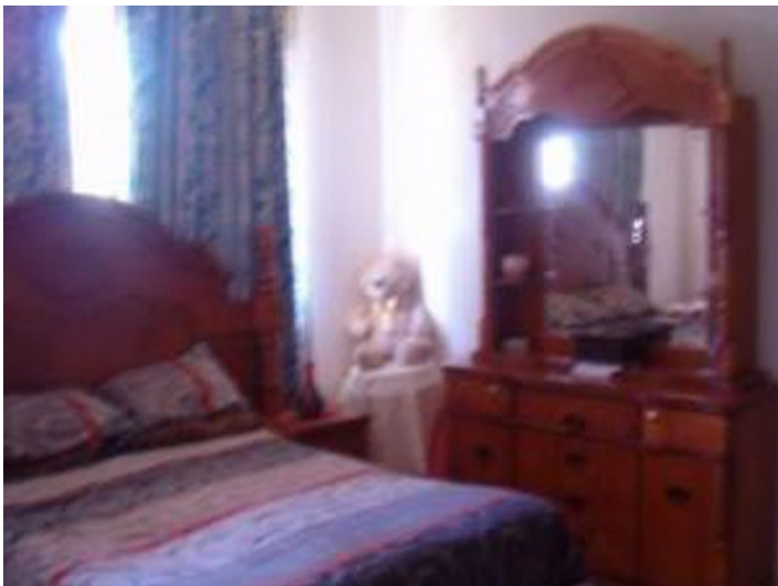
Bedroom with king size bed