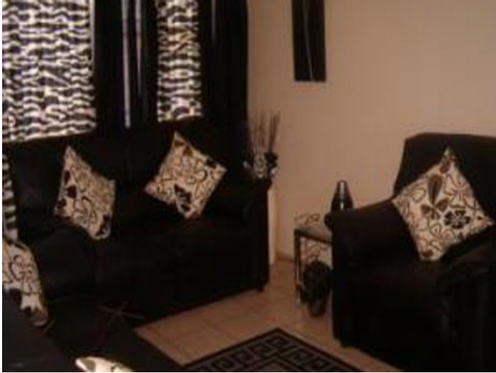
Enjoy your spare time in the huge living room