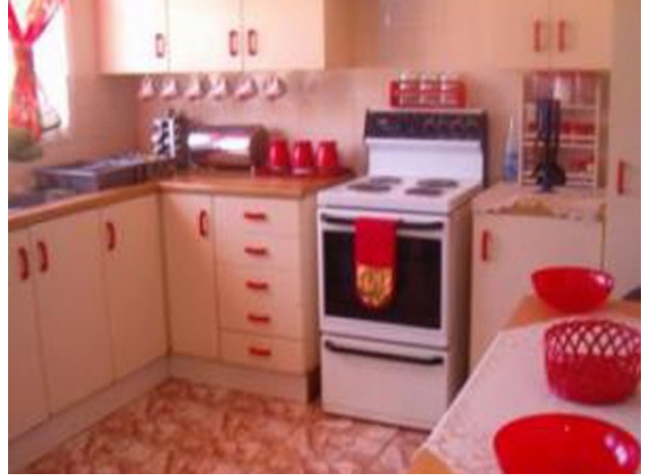
Bright and spacious kitchen area