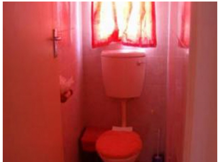
Toilet and bathroom with huge bath