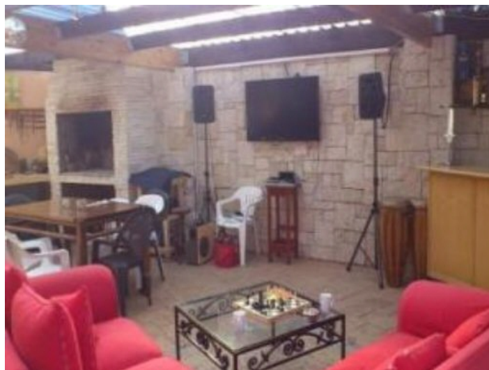
Nice living area

All information is correct to the best of our knowledge. Errors and prior sale excepted. This prospectus is purely for information purposes. Only the notarized deed of sale is legally binding.