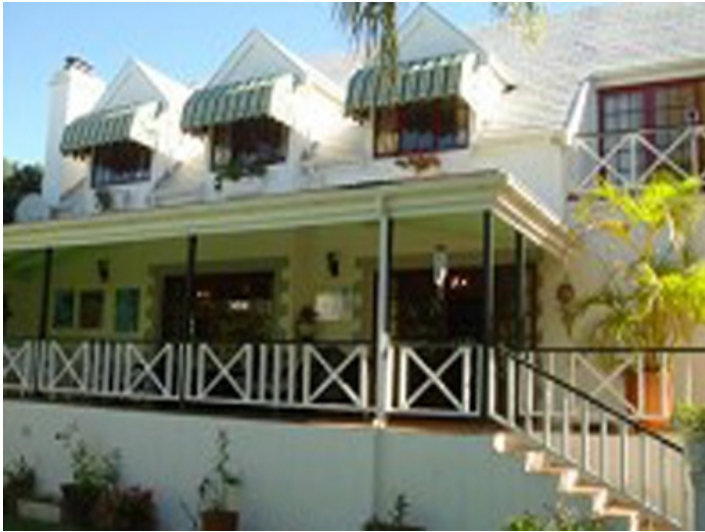
Direct access to the house