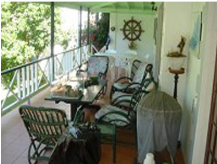
Open veranda to enjoy the summer