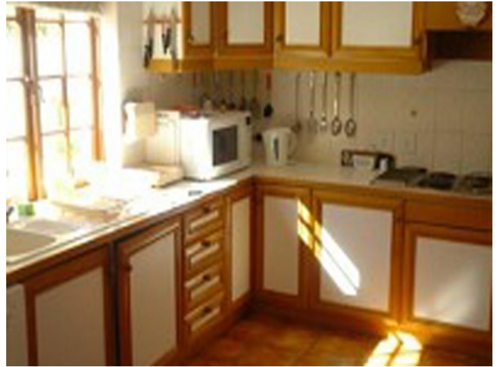
Bright and spacious country style kitchen