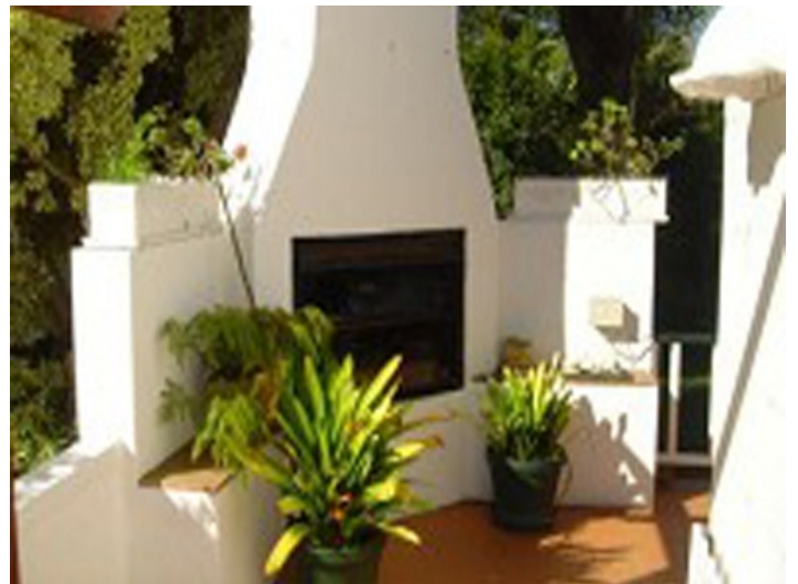
Braai area to spend time with family and friends