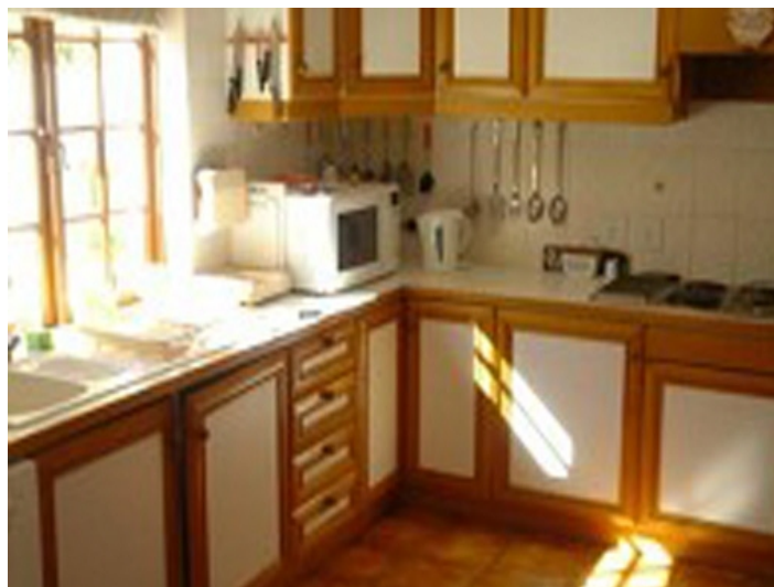
Bright and spacious country style kitchen