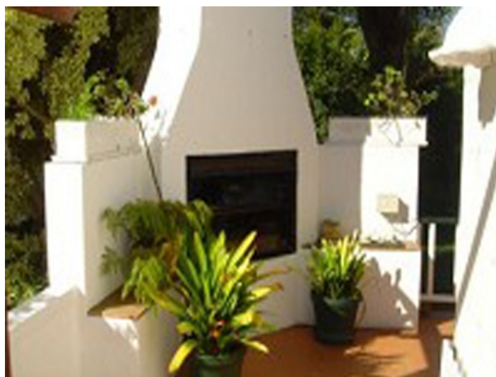
Braai area to spend time with family and friends