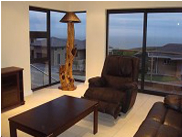
Huge and bright TV area