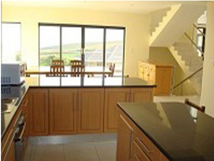
Huge kitchen area