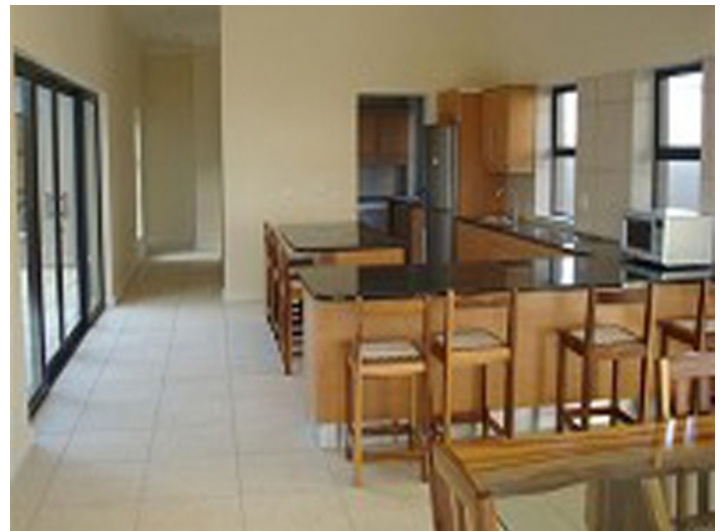
Spacious kitchen area