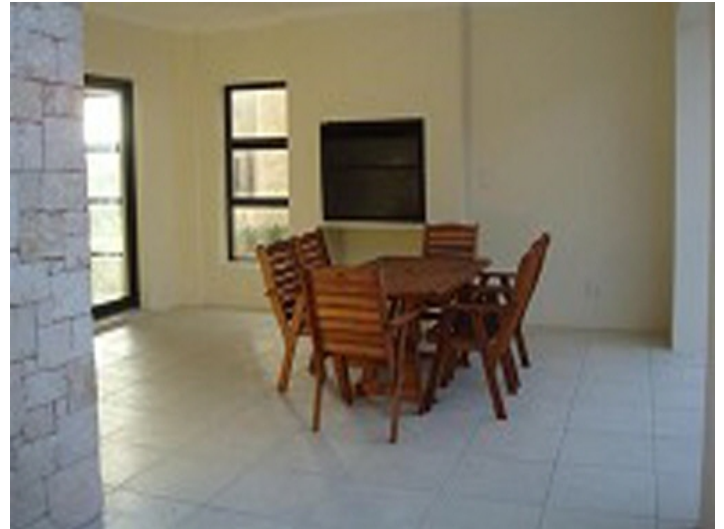
Dining area with big table