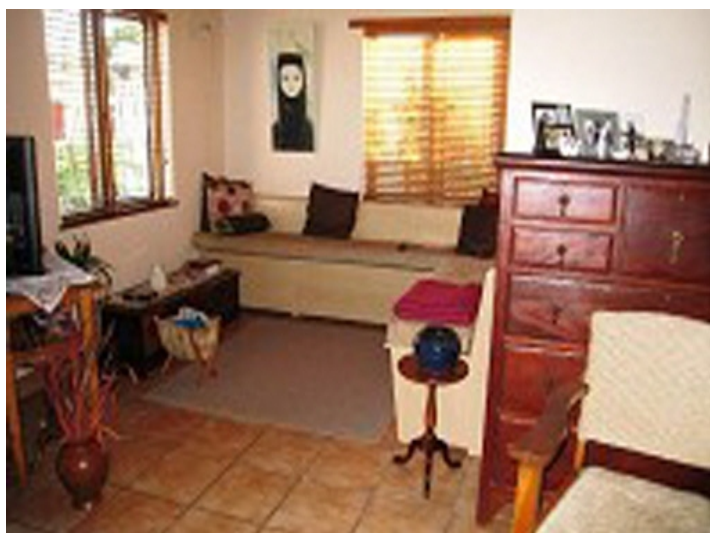
One of the 3 huge bedrooms