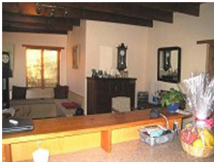
Bright and spacious living area