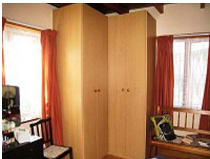
Another view of the bedroom