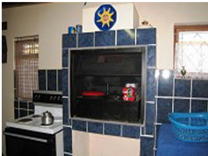
Comfortable kitchen with braai