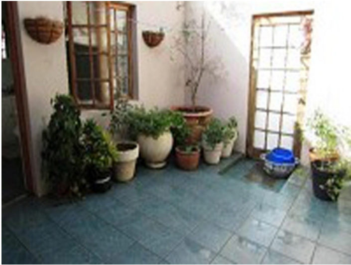
Outside area with flowers