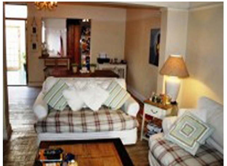
Bright and spacious living area