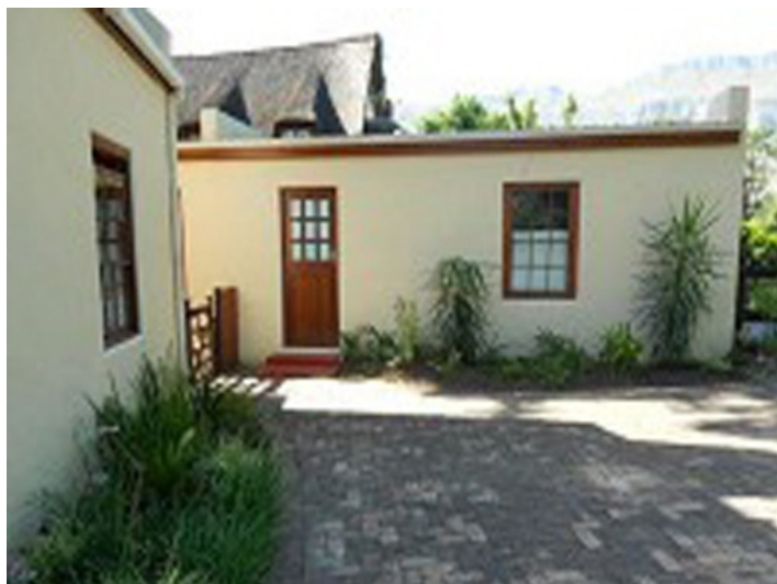
Beautiful views to the mountains