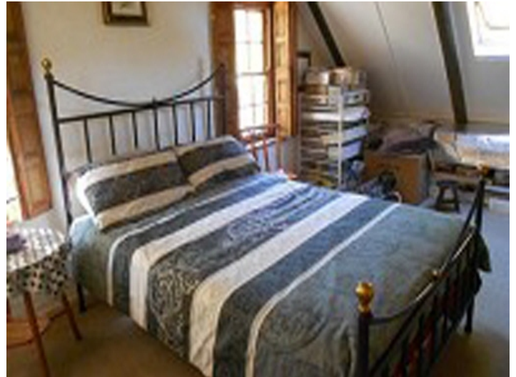
Sunny garden with oak tree and braai