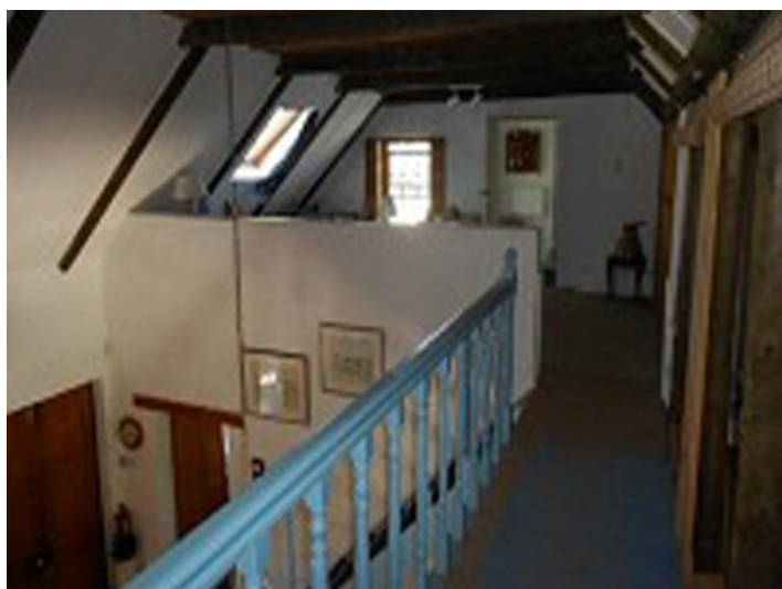
Nice terrace in the property