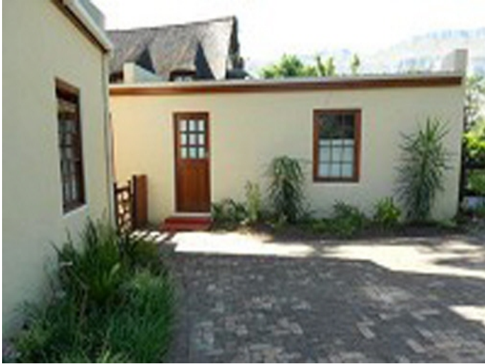
Beautiful views to the mountains