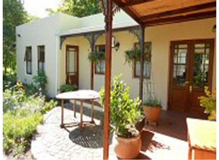
Entrance and garage view