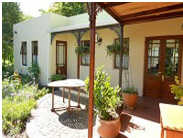
Entrance and garage view