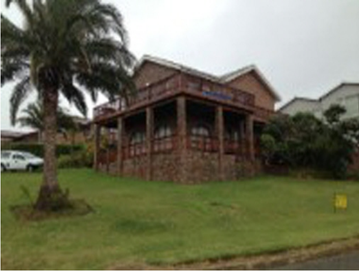
General view of the property