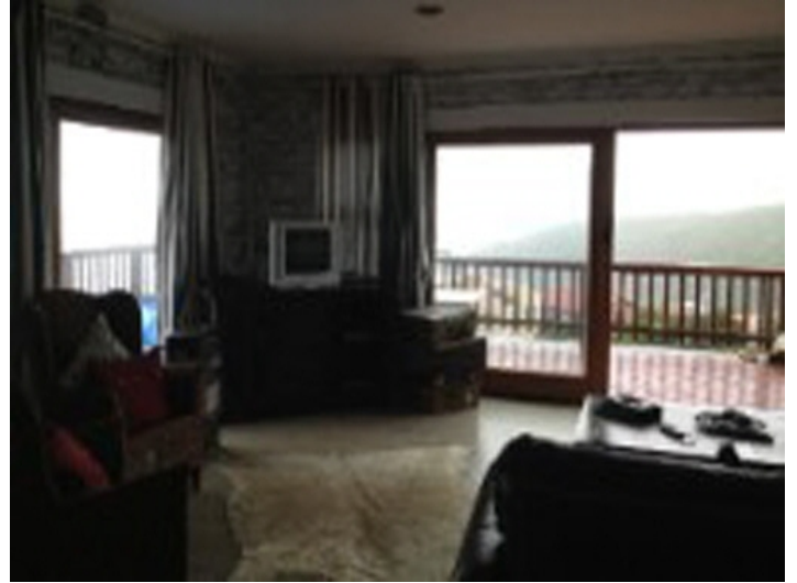
Spacious and bright living area