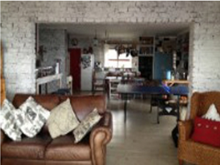
Living area near the kitchen