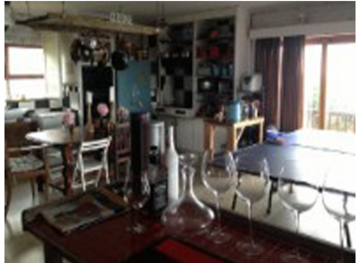
Spacious and comfortable dining area