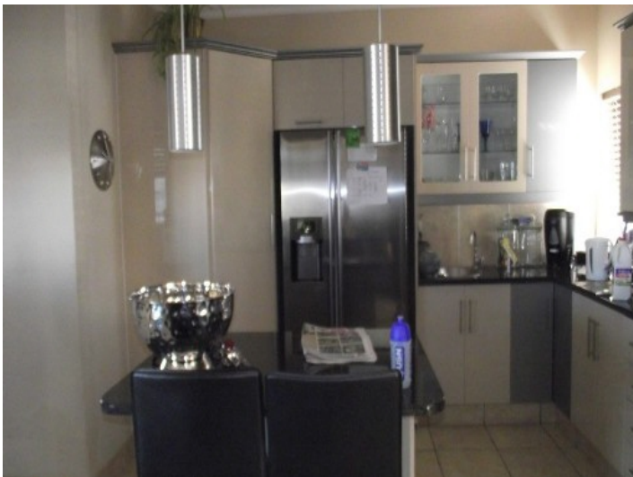
Modern kitchen with dining area