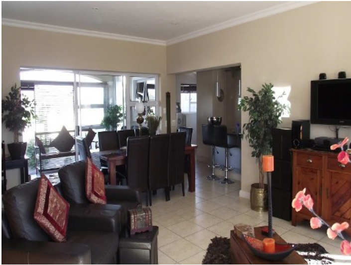
Comfortable living room