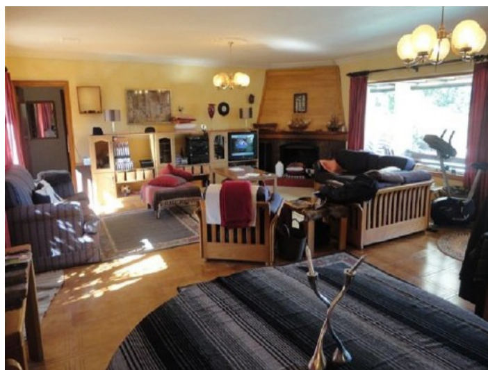
Spacious living room with fireplace