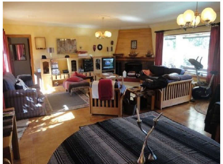
Spacious living room with fireplace