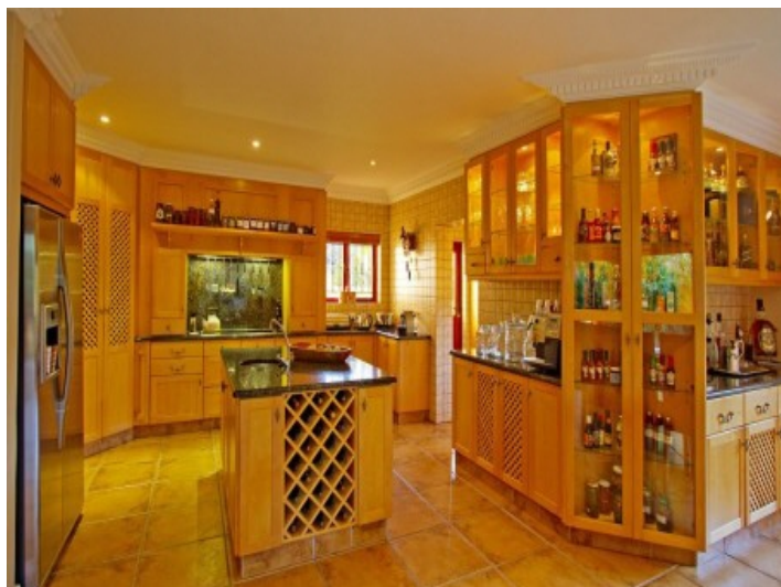
Modern gourmet kitchen