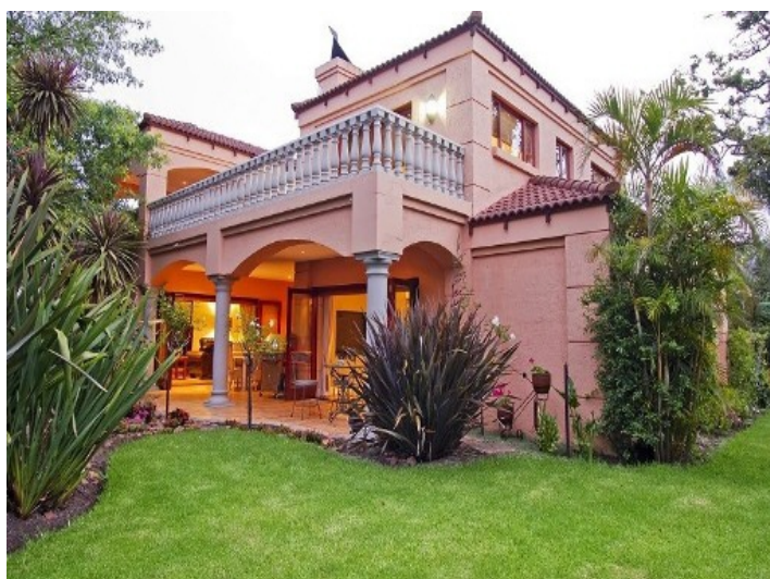
Terrace with big garden

All information is correct to the best of our knowledge. Errors and prior sale excepted. This prospectus is purely for information purposes. Only the notarized deed of sale is legally binding.