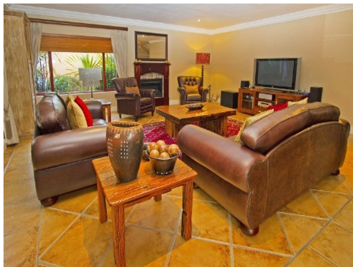
Spacious living room