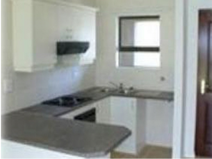
Fitted kitchen area