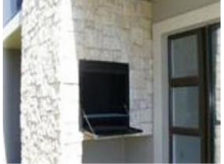
Balcony view in the apartment

All information is correct to the best of our knowledge. Errors and prior sale excepted. This prospectus is purely for information purposes. Only the notarized deed of sale is legally binding.