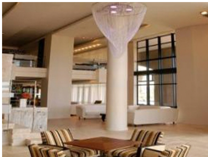
Bright and spacious hall