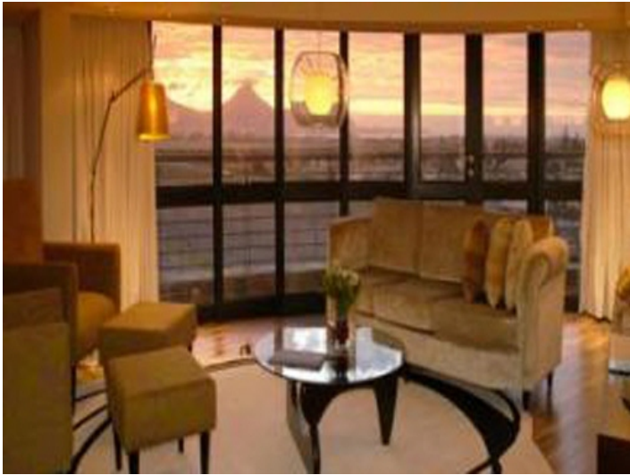
Luxurious living area in the penthouse