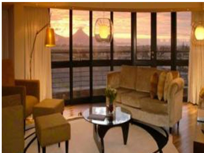
Luxurious living area in the penthouse