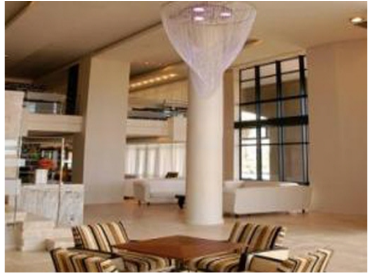
Bright and spacious hall