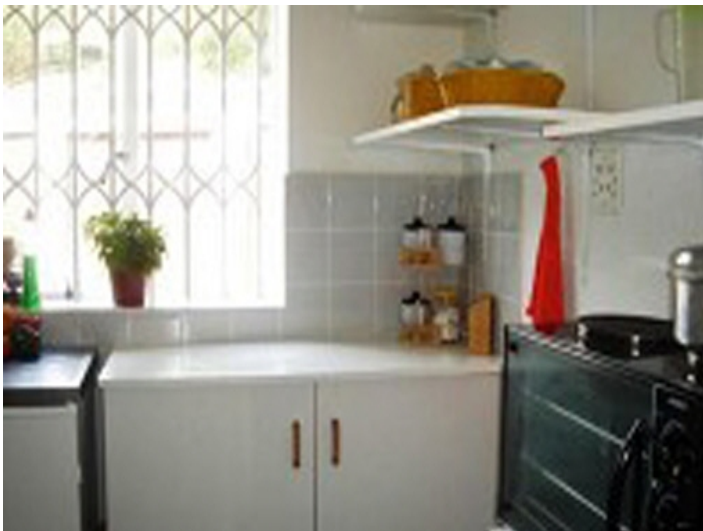
Bright and spacious kitchen area