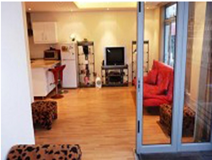
Comfortable kitchen area