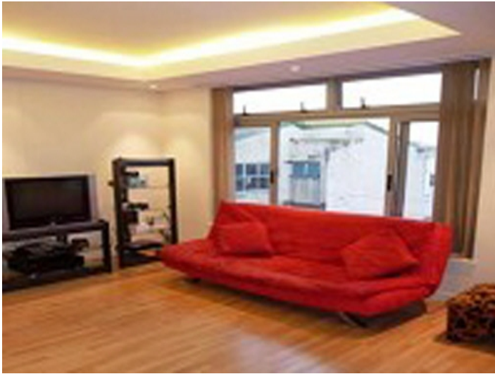
Large living area