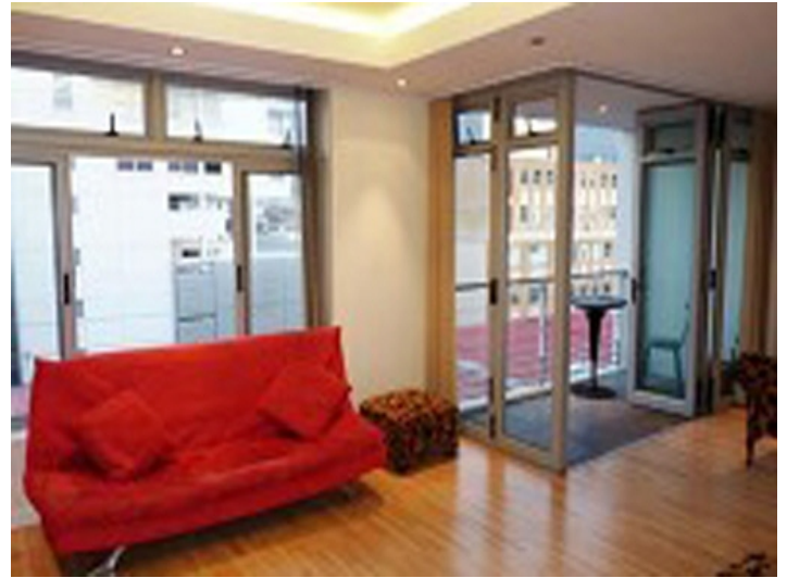
Bright and spacious living area