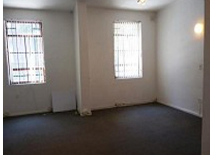
Huge area suitable for bedroom