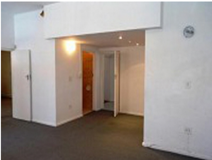
Entrance leading to the living area

All information is correct to the best of our knowledge. Errors and prior sale excepted. This prospectus is purely for information purposes. Only the notarized deed of sale is legally binding.