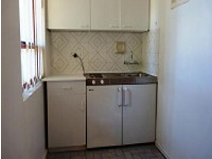
Small and comfortable kitchen area