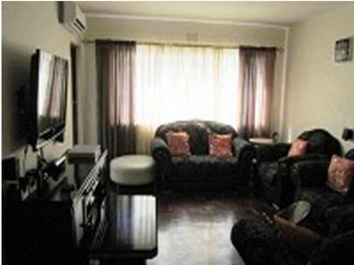
Spacious and bright living area