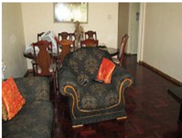
Comfortable furniture in the living area