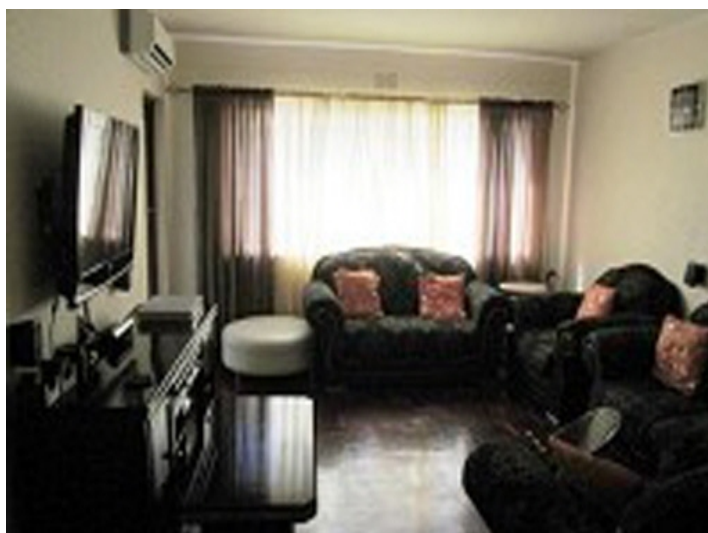
Spacious and bright living area