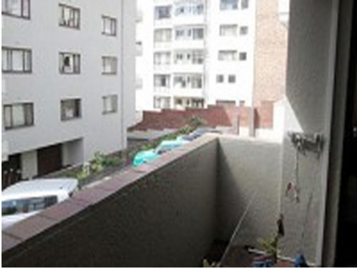
View to the surrounding area