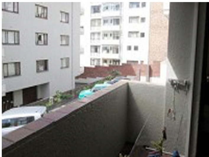
View to the surrounding area