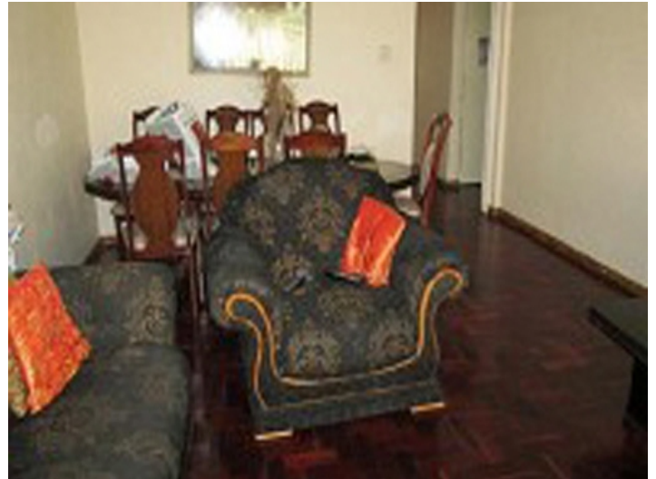
Comfortable furniture in the living area